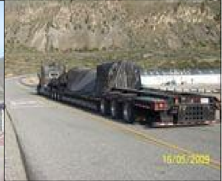
Hydropower water turbine, Dimensions: 30' x 6' x 6' 145,500 pounds